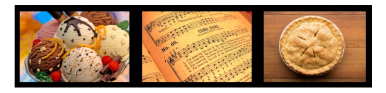
Potluck Supper & Hymn Sing

Raising funds for the Centretown Emergency Food Centre so that they can support their mission to provide a supply of nourishing food to those in need. You can be a walker, or support others who are walking. All the info is available online (www.centretownchurches.org/walk/).