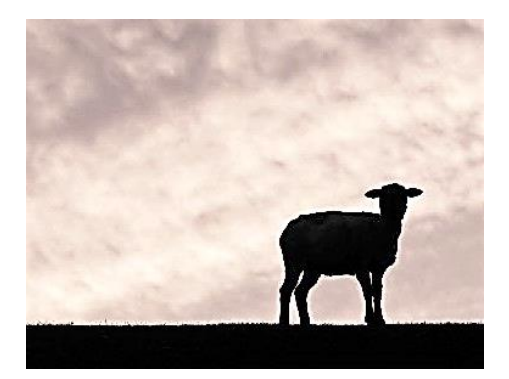
Diocese of Ottawa