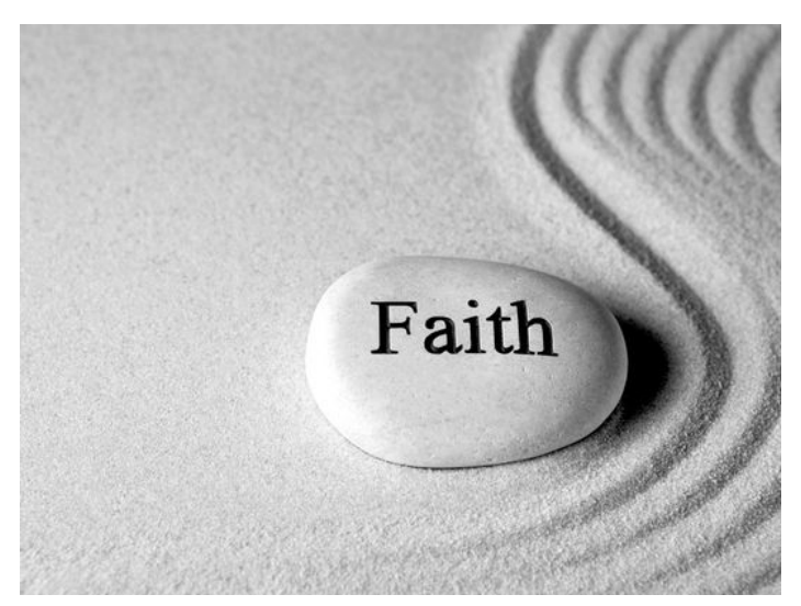
SIXTH SUNDAY AFTER PENTECOST